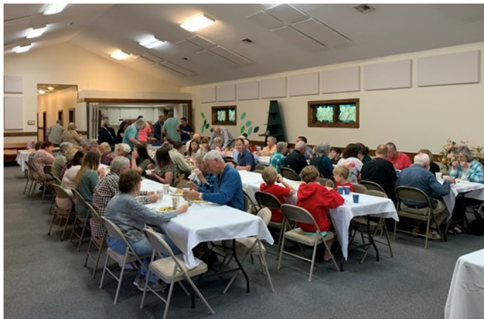
Family Night Supper in the Fellowship Hall

Join us for dinner in the Fellowship Hall on Wednesday, February 1st at 6:00pm! If you're able, please bring covered dish to share (side, salad, dessert, or some kind of entrée). If not, come anyway! We would be honored to host you.