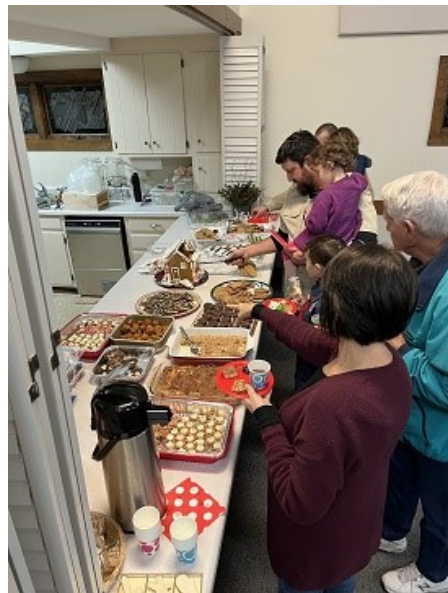
Cookie making with the Children's Ministry and the Cub Scouts!