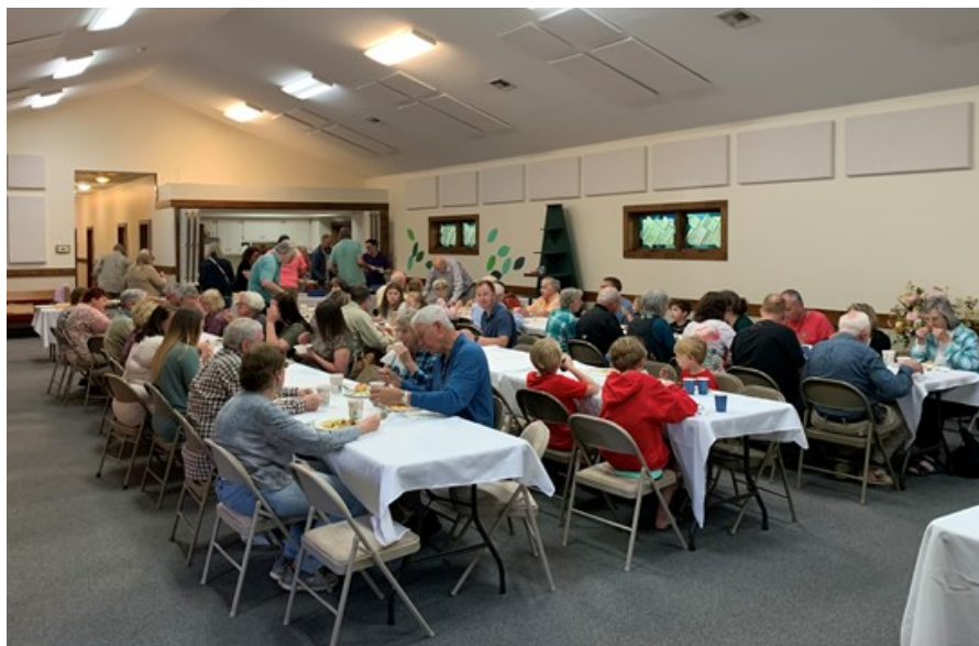
Family Night Supper in the Fellowship Hall

Join us for dinner in the Fellowship Hall on the first Wednesday of the month at 6:00pm! If you're able, please bring covered dish to share (side, salad, dessert, or some kind of entrée). If not, come anyway! We would be honored to host you.